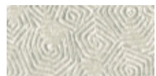
Zincalume®Plus/ Galvalume® SRI-5