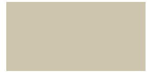
Light Stone SRI-68