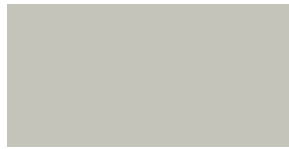
Stone White SRI-71